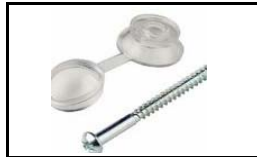
SCREWS & CAPS